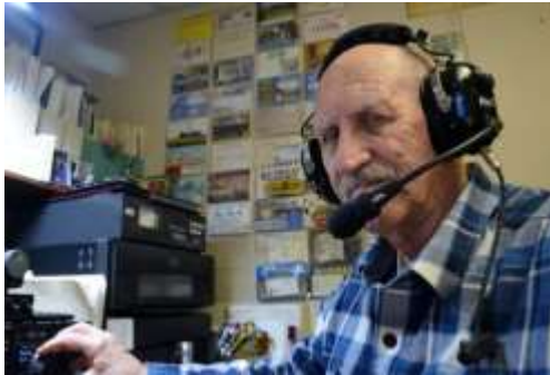
Your Host WA2AXO February 12, 2019

Those who showed on the repeater were, WA2AXO, K2RIW.